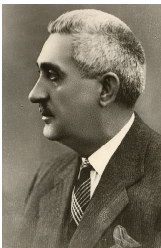
Fig. 3 – Mihai David (1886–1954).