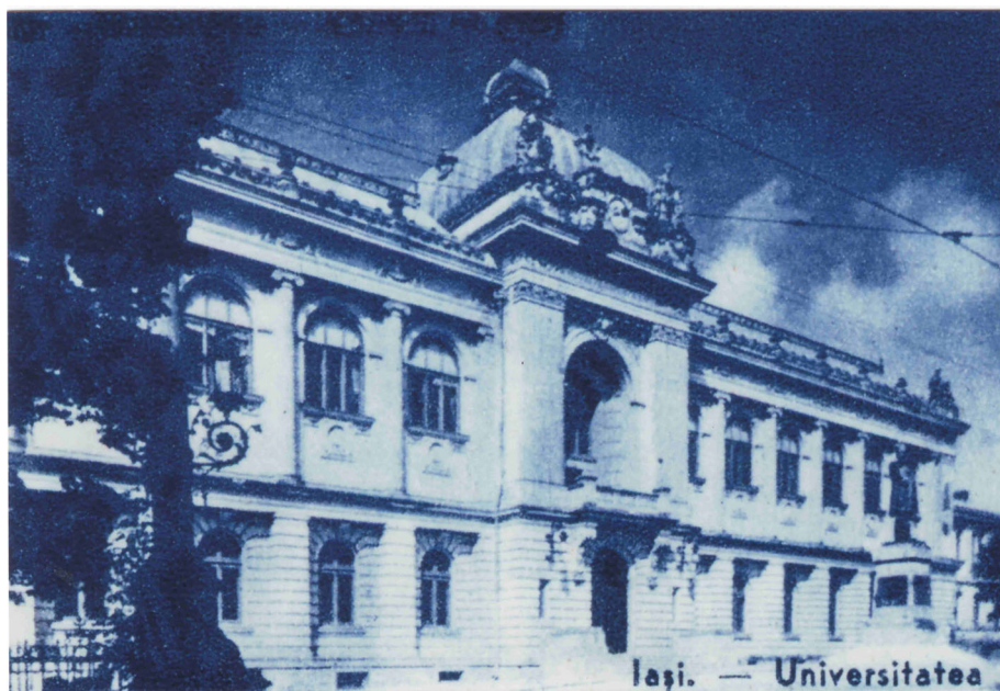
Fig. 1 – The main building of Iași University in 1929.