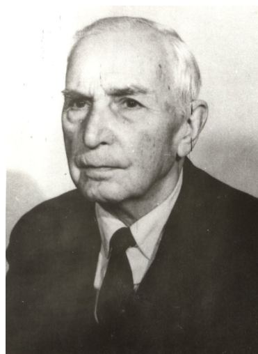
Fig. 4 – Gheorghe I. Năstase (1896–1985).