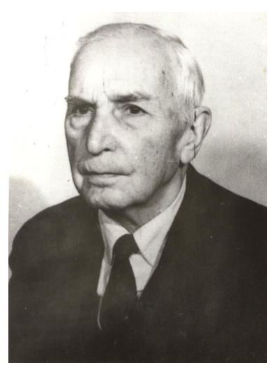
Fig. 4 – Gheorghe I. Năstase (1896–1985).