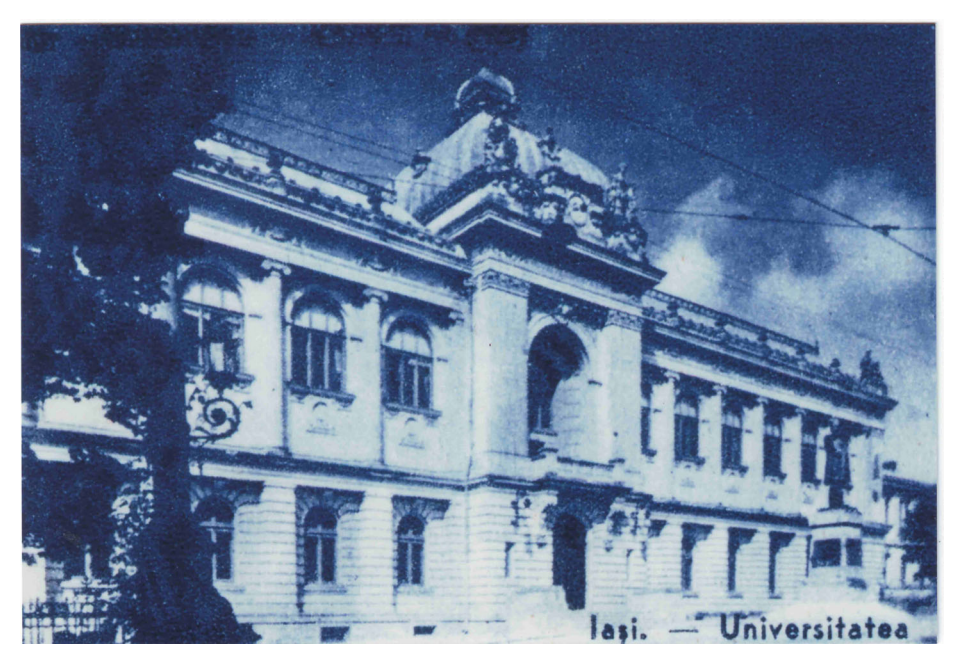
Fig. 1 - The main building of Iași University in 1929.

being taught in Romanian higher education. Noteworthy is the course in geography given by Grigore Cobâlcescu (Fig. 2) at the Iaşi School for the Sons of militaries and published in 1888 in two volumes: The Physical Geography of Modern Dacia and The Physical Geography of the Romanian Countries and of the Neighbouring Countries . Under the Law of 1898, the Section of History of the Faculty of Philosophy and Letters became Section of History and Geography, also offering a BA degree in Geography.