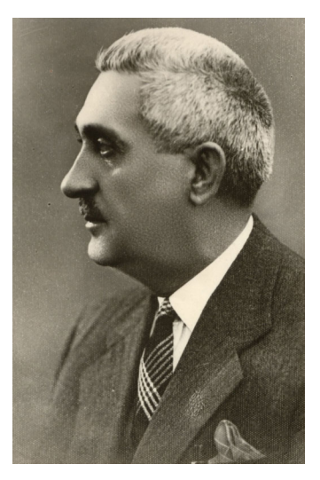
Fig. 3 – Mihai David (1886–1954).